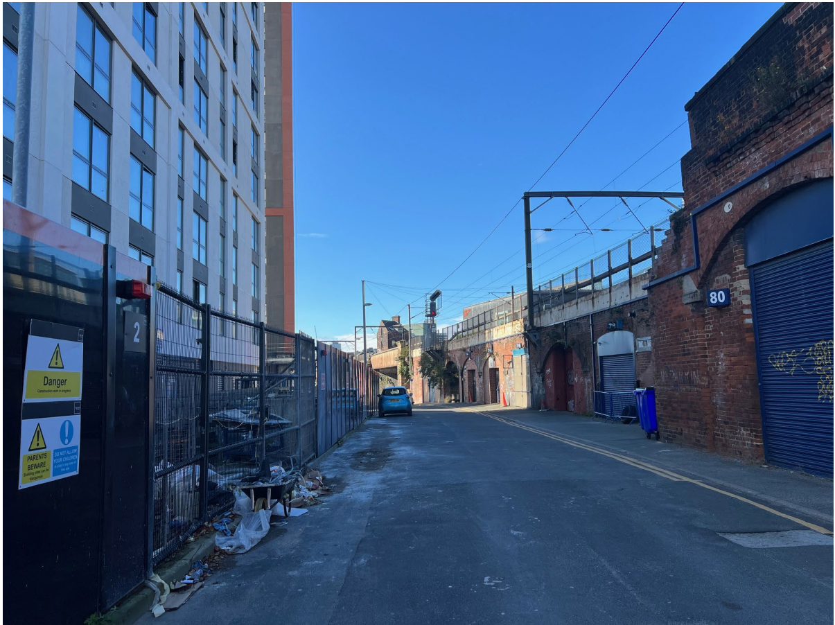
Item 5: looking out to where the new affordable, family flats will be from the entrance of the bar.